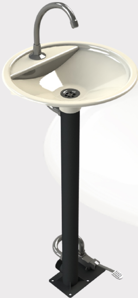
Free Standing Series

Supporting the campaign of CHSE - Cleanliness, Health, Safety and Environment, it's pre-packaged self contained unit comes complete with all accessories, easy installation details, just "plug in and wash away"