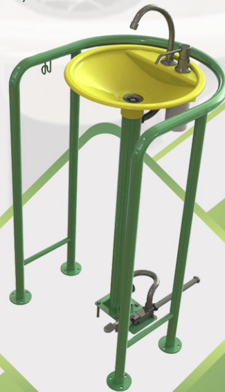
with Grab Bar