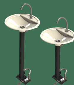
Available for Children (Height: 700mm)